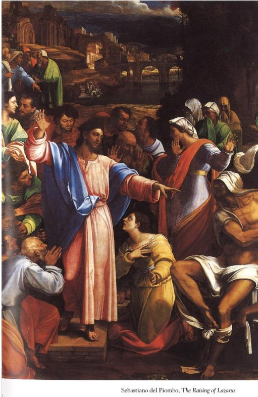
Sebastiano del Piombo, The Raising of Lazarus

1700 West Main Street, Jeffersonville, PA 19403 (610) 539-1693