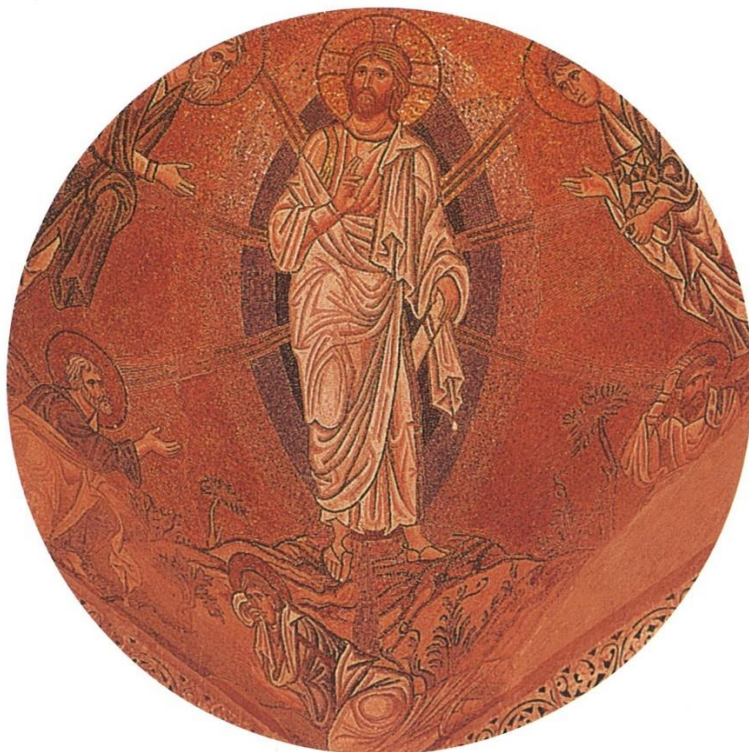
Byzantine mosaic, The Transfiguration

1700 West Main Street, Jeffersonville, PA 19403 (610) 539-1693